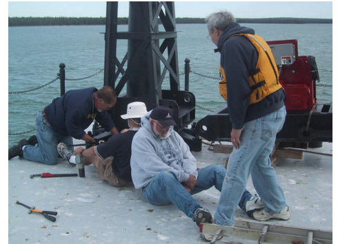
How many DRLPS members does it take to tighten a nut

The total cost of the crane was $52,000. The DRLPS raised $17,300 and the State will reimburse the society $34,600.